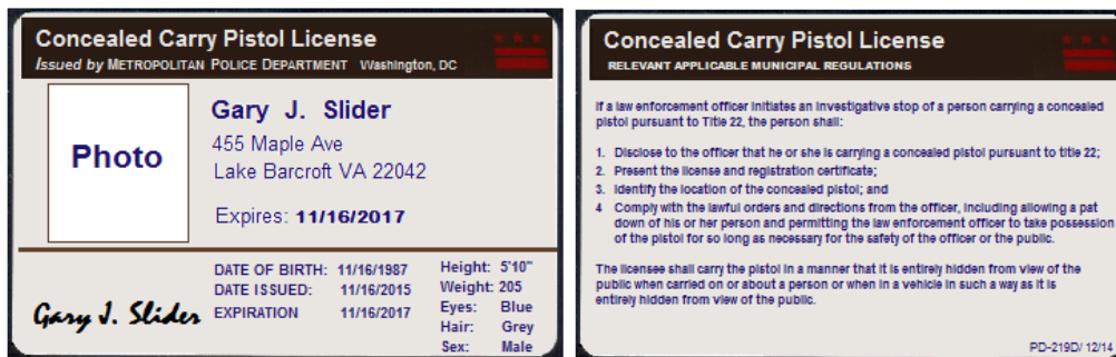
This image gives a very good representation of the District of Columbia Carry License.